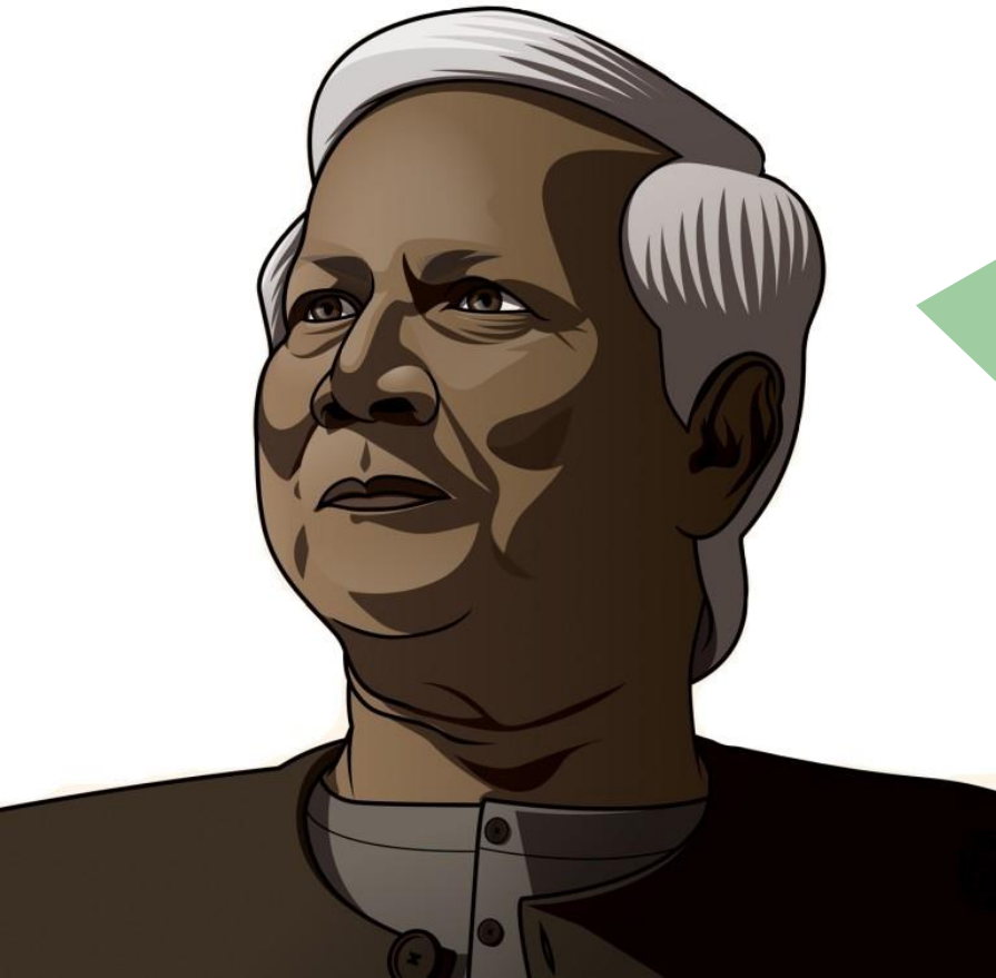
Muhammad Yunus, Social Entrepreneur and Nobel Peace Prize Winner

“Engaging in social business is beneficial to a company because it leverages on business competencies to address social issues, involves one-time investment with sustainable results, and produces other positive effects such as employee motivation and improved organizational culture.”